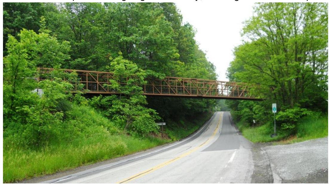
2010 photos Bryan Seip

Over Rt. 980 near Quicksilver Road, now replaced by steel truss Trail bridge. Original abutments were placed along edge of roadway, creating a narrow underpass.