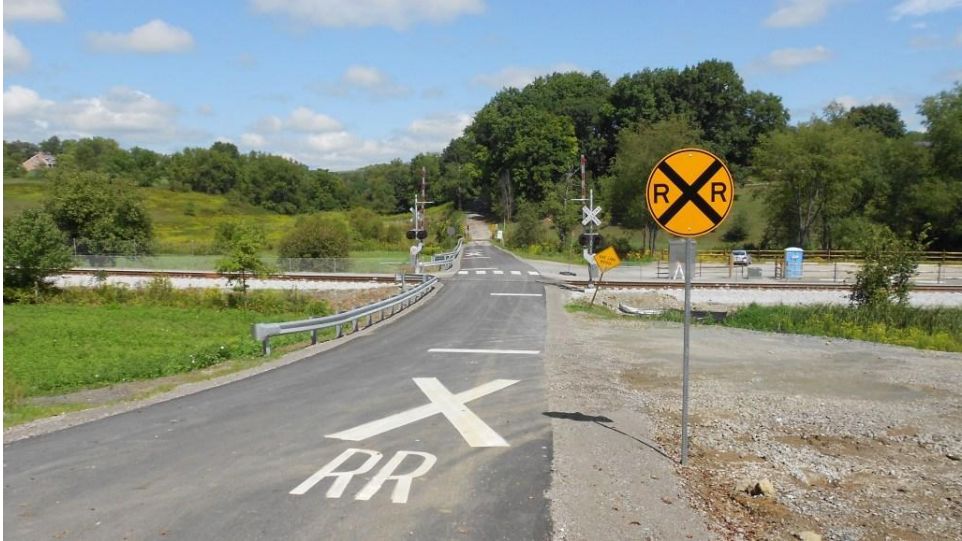
2012 photos Bryan Seip

Similar view in 2012 shows reconstructed railroad. Although the profile of the right-of-way was re-graded, Galati Road remains a grade crossing, now with rail and trail.