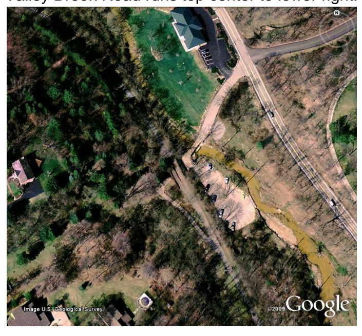
Composed by Montour Railroad Historical Society members

Satellite view shows bridge at center, with Pelipetz Drive and parking area. Valley Brook Road runs top center to lower right. Maplewood Drive is at top right.