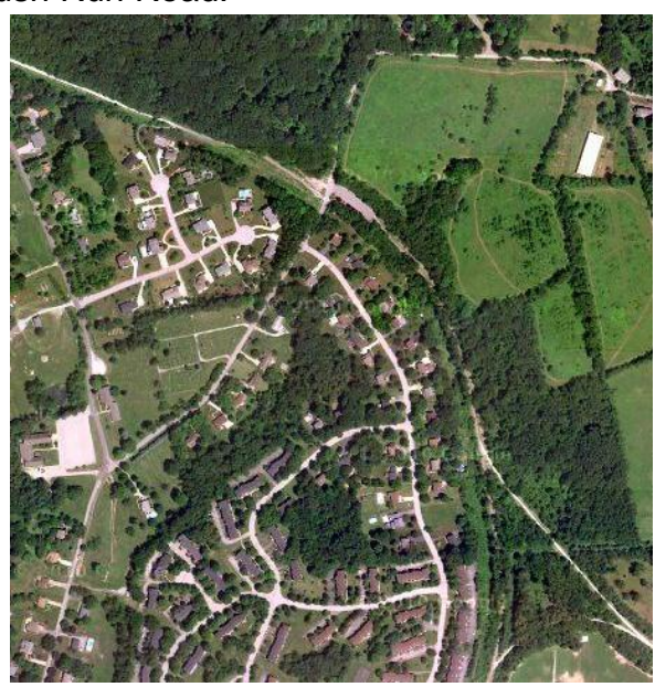
2011 view