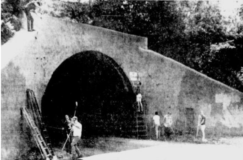
The Pittsburgh Press – Sept. 2, 1966

Newspaper photo from 1966 shows east portal being painted by local residents to cover graffiti. This view is from the intersection of Logan & Irishtown Roads. The clean-up only lasted a few days before the graffiti was reapplied.