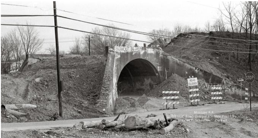
Logan & Patterson Roads.

These views were taken during removal of the bridge in March, 1987.