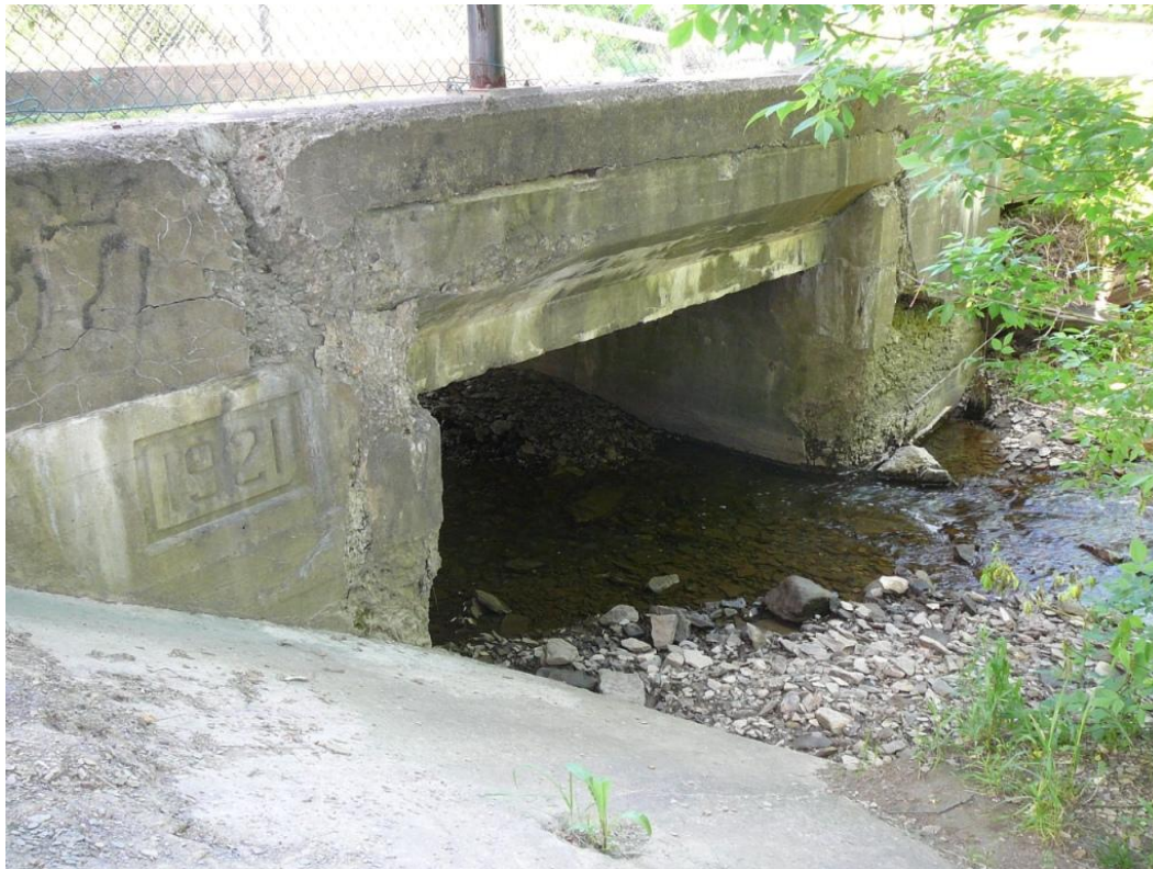
Looking west – 1921 in concrete. This bridge was installed during one of the upgrade/realignment projects of the original main line during the 1920's