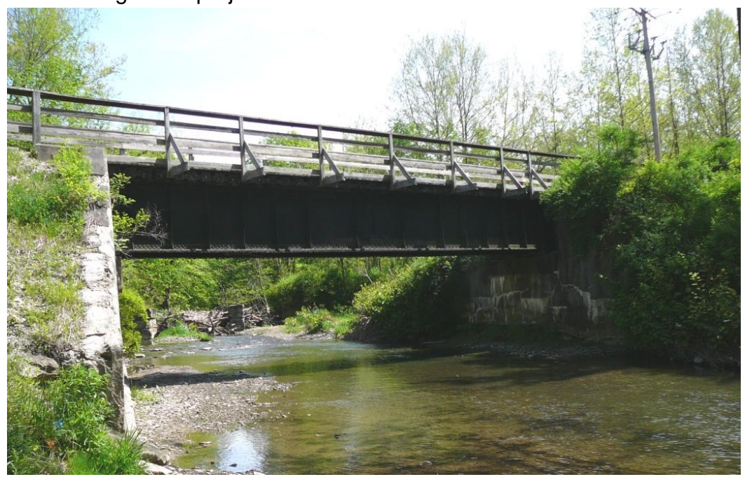
2010 photos Bryan Seip

View looking south. This bridge has no dates evident, but two other bridges built in the same re-alignment project are dated 1920.