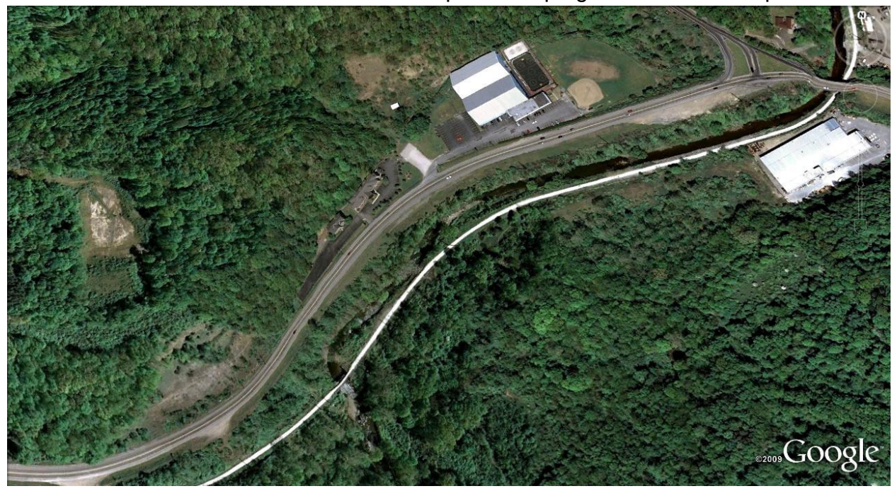
Old abutments on original Right-of-Way carried a 3 span bridge.

Satellite view shows bridge at lower center. Montour Run Road parallels Right-of-Way, with Beaver Grade Road intersection & overpass at top right. YMCA is at top center.