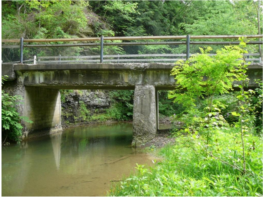
2010