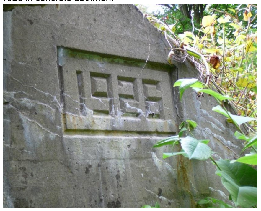
1926 in concrete abutment

Looking east (RR West) – cut through hillside on far side of bridge is seen on topo map. Railings and fence were installed for Trail use. The railroad had no side railings on this bridge.