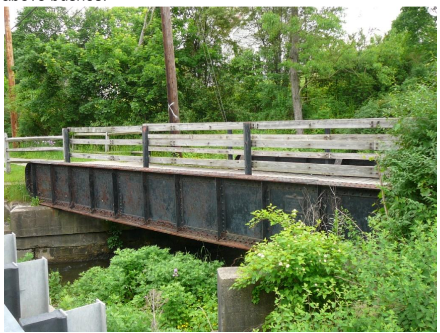
2010 photos Bryan Seip

Looking south from Main Street – Builder's Plate on right end of bridge can be seen just above bushes.