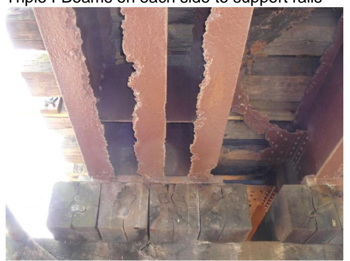
Triple I-Beams on each side to support rails