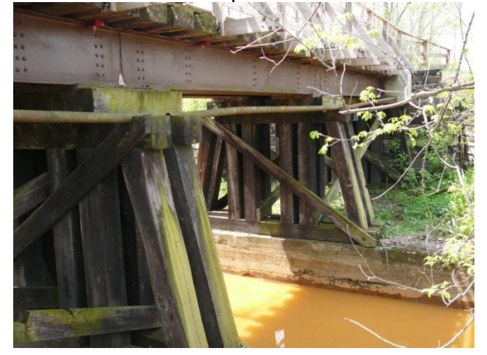
Compiled by Montour Railroad Historical Society