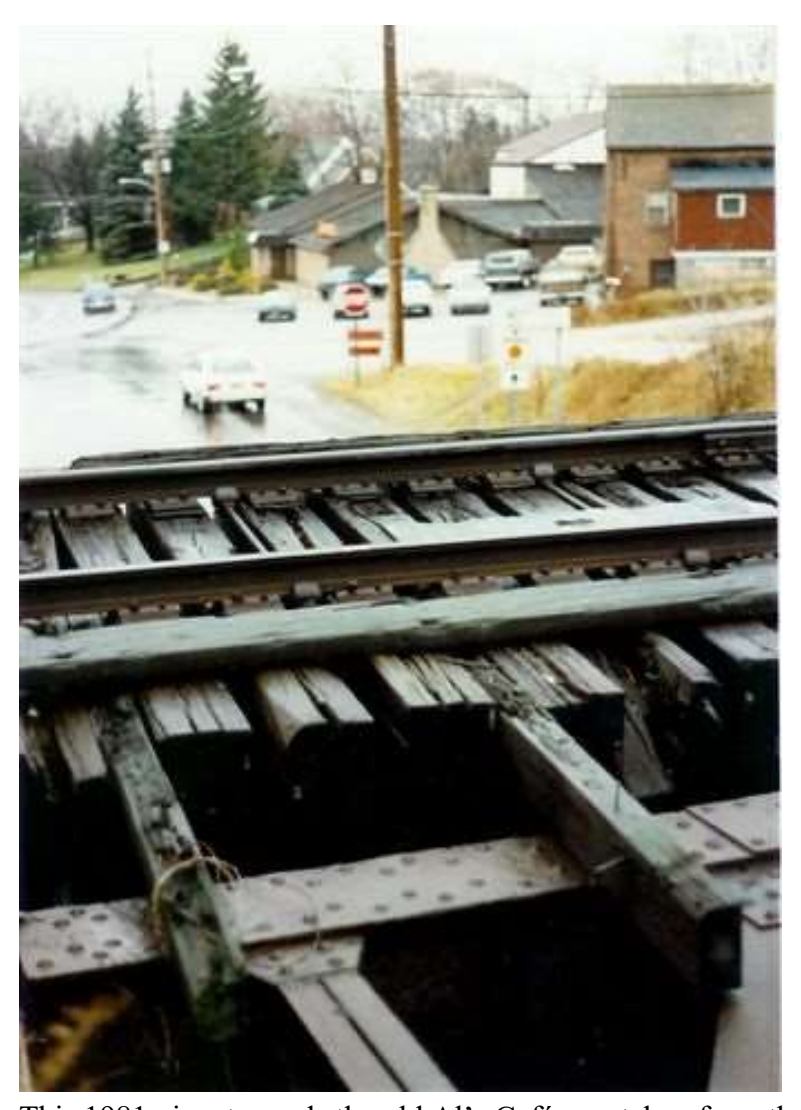
This 1981 view towards the old Al's Café was taken from the Jewell Siding bridge span.

This column appeared in the November-December, 2020 Montour Trail Newsletter. For more information on the Montour Trail – go to <a href="https://www.montourtrail.org">www.montourtrail.org</a>