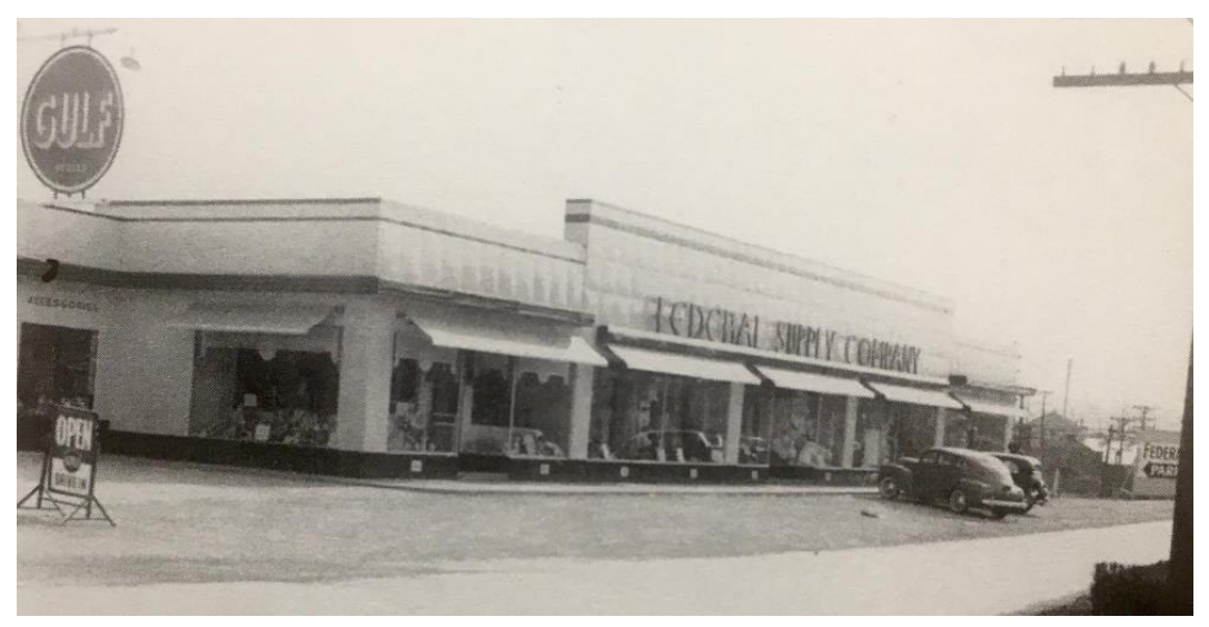
The Federal Supply Company store was dedicated in 1941. It is now known as Champion Plaza.

In the early years of the mine's operation, two small company stores provided groceries and other necessities to the miners and their families. A store was in each of the housing patches, one above Victory Drive and the other on Downing Street.