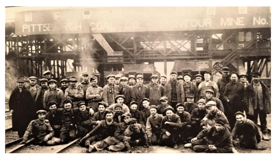
Miners pose in front of the Mine #10 tipple in 1920.

The mine started operation in 1883 in Bruceton and was known as the Lick Run Mine. The Pittsburgh Coal Company bought and consolidated many of the area mines in 1900-1901 and operated Lick Run until the Montour Railroad was constructed into Library. New entrances and a tipple building were built in 1918 and designated as Montour Mine #10 with the Lick Run coal reserves being reassigned to this new mine. The mine used two entrances, one on either side of the Piney Fork valley. One portal was on the north side above Wood Street and the other was on the south side of the valley, entering under Cardox Road. As the coal seam came to the surface on the hillsides and could be directly accessed, no vertical shafts were needed.