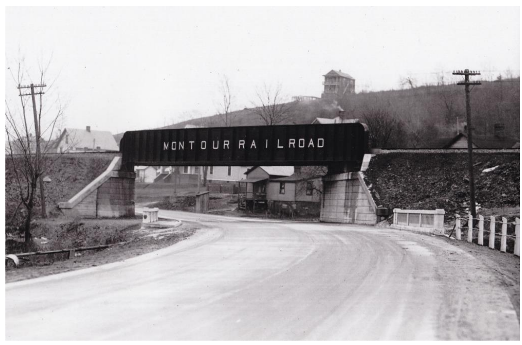
A 1930 view of the bridge eliminating a dangerous grade crossing of Rt. 30.

Several coal mines serviced by the Montour Railroad were located in or near Imperial. The Marshall Mine was northeast of town, with a railroad spur crossing McClaren Road to reach the mine. The Clinton Block Mine was on a spur running on the north side of Route 30, reaching the mine near the current Findlay Township Sports Complex. The Margerum Mine in Imperial was mentioned earlier. Jean Mine was located south of Imperial above North Star Road. Partridge Mine was further south of town at the end of the original railroad line at North Star. Several mines were also located in the Boggs area, including the Sunnyhill, Maraca, Rider, Solar, Boggs and Russell #2 mines.