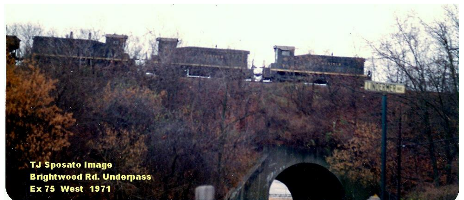
Near Rt. 88 in 1971, Montour diesels lead a string of empty hoppers from West Mifflin to coal mines in the area.

The right-of-way in Bethel Park was converted to trail use in 1998-2000.