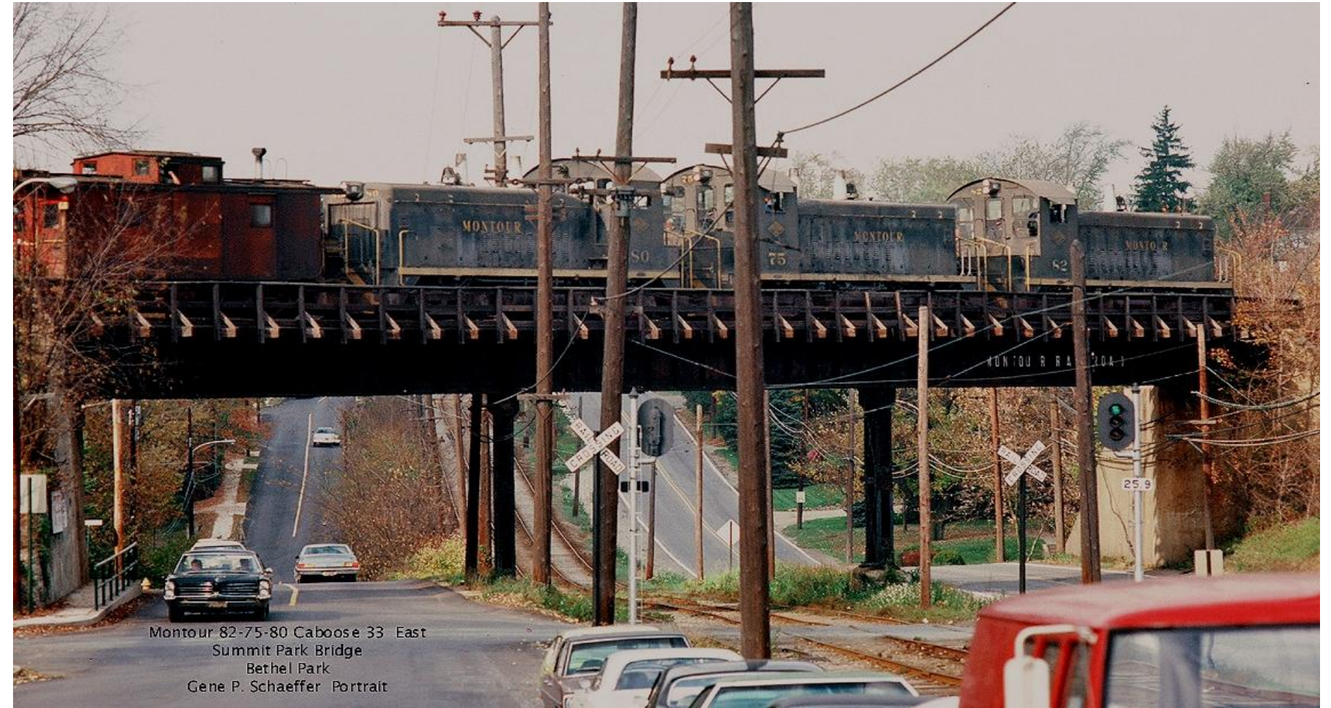
Montour locomotives cross over Library Avenue, the PAT trolley tracks and Brightwood Road, ca. 1975.

For more information go to: montourrr.com