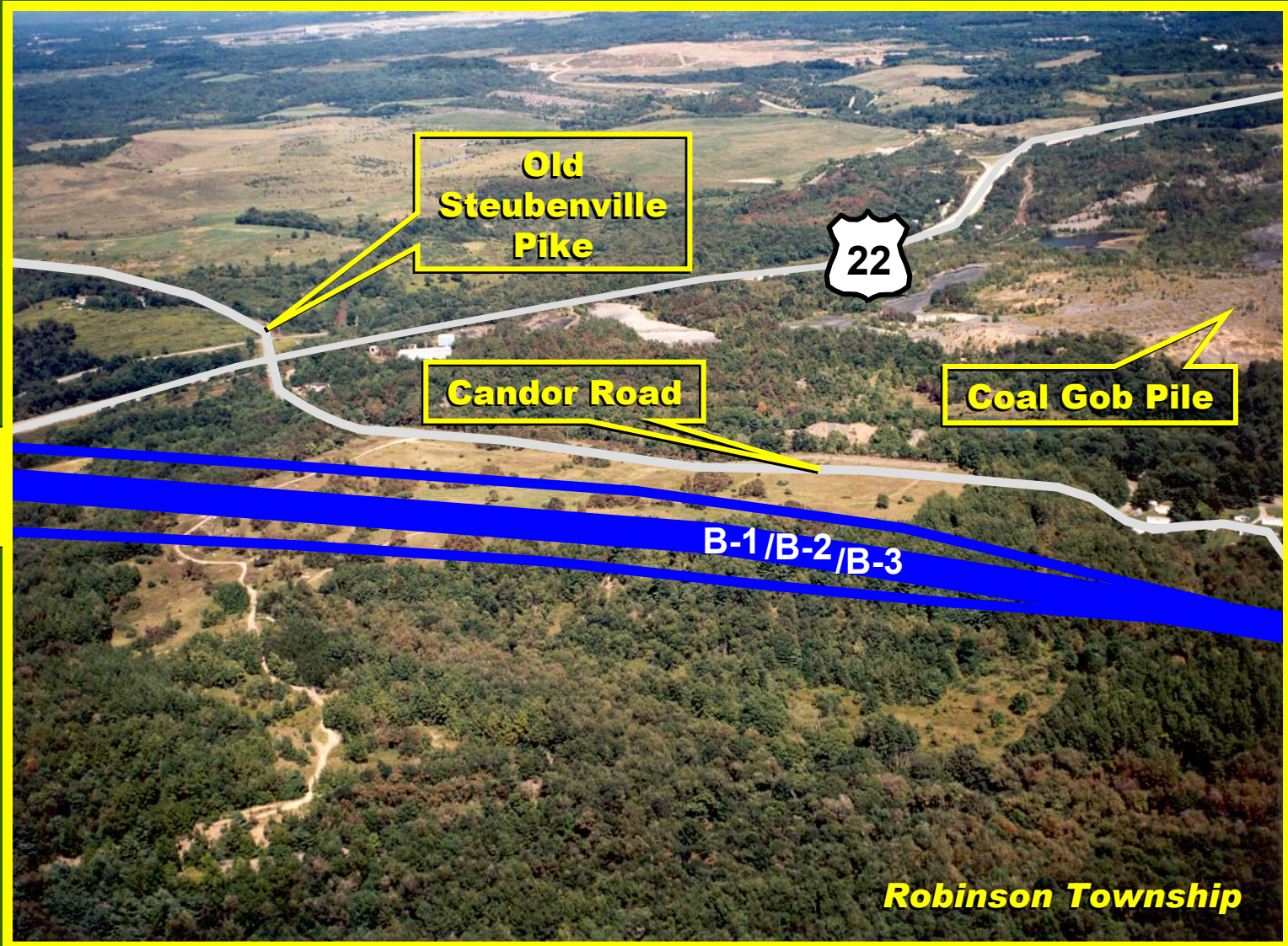
The Common West B-1/B-2/B-3 Alternative continues east, just south of and parallel to Candor Road.